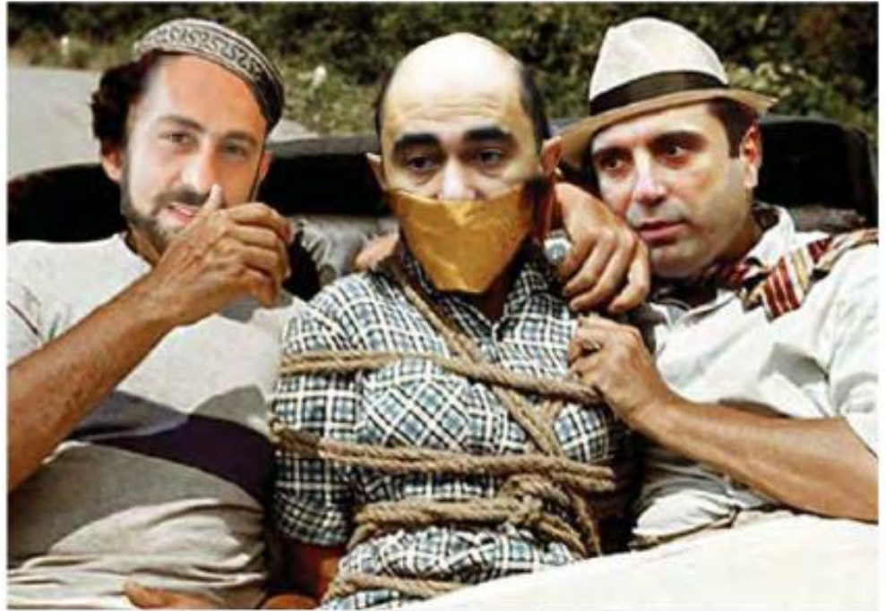
ՉԱՄԱՐՅԱ «ԿՈՎԿԱՍԻ ԳԵՐՈՒՅԻ» (ԼՂԿ-Ի ԵՎ ԻՆԽԱՆՈՒԹՅՈՒՆՆԵՐԻ ՄԻՋԵՎ ԽՈՐԱՅՈՂ ԱՆՋՐՊԵՏԻ ՉԵՏԵՎԱՆՔՈՎ ԼՂԿ-Ի ԶՆՆԱԳՎԱՏՈՒԹՅՈՒՆՆԵՐԻ ԿՎՊԱԿՅՈՒԹՅԱՄԲ) ԼՂԿ-ն կարող է ճշալ, բողոքել, բայց դա կովկասյան հին ավանդույթ է: